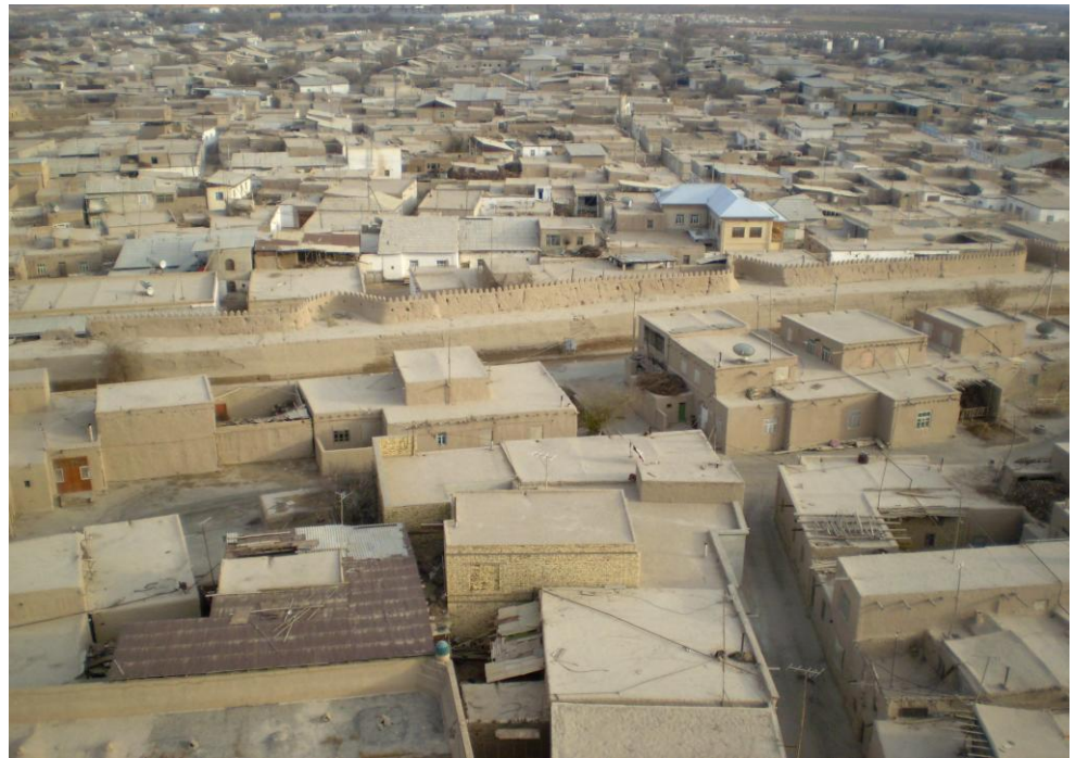
Residential areas in Khiwa, Uzbekistan.