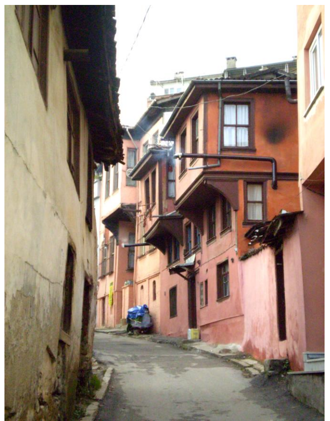
A residential area in Bursa, Turkey.