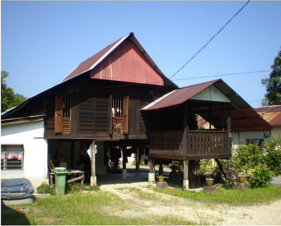
A house in Penang, Malaysia.