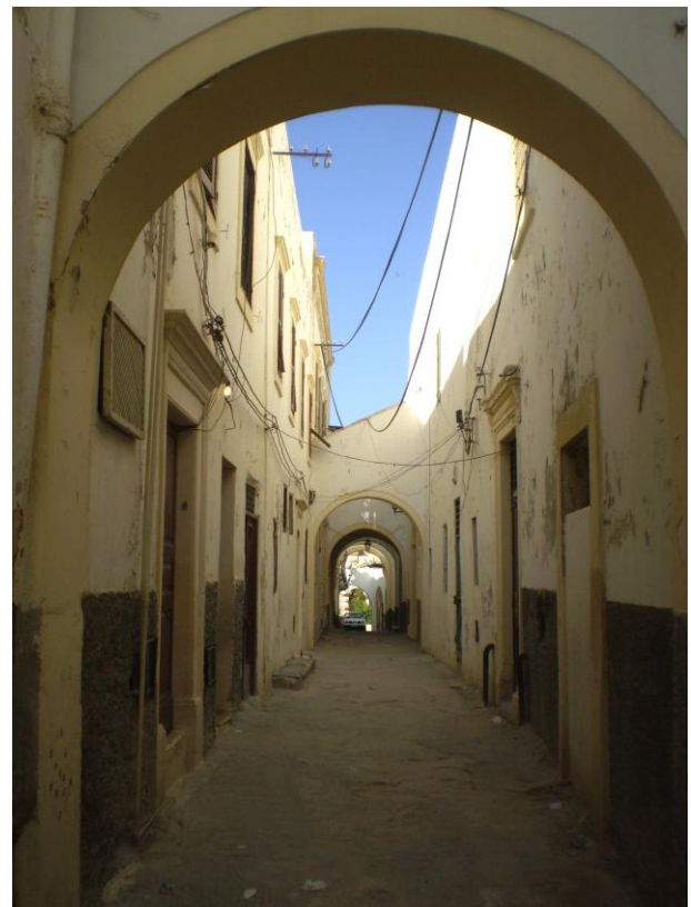
A narrow street running through a residential area in Tripoli, Libya.