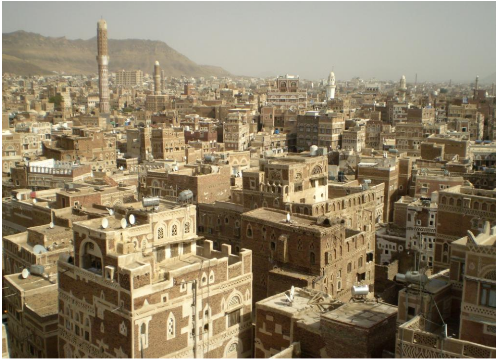
Residential areas in San'a, Yemen.