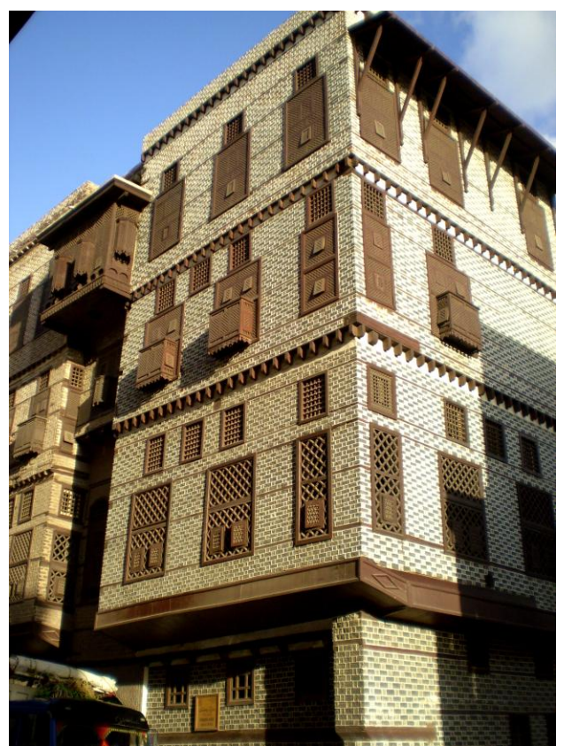
A traditional house in Rashid (Rosetta), Egypt.