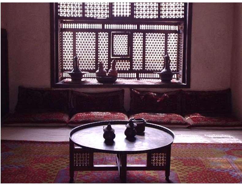
An ambiance behind a screened window in a traditional house in Cairo, Egypt.