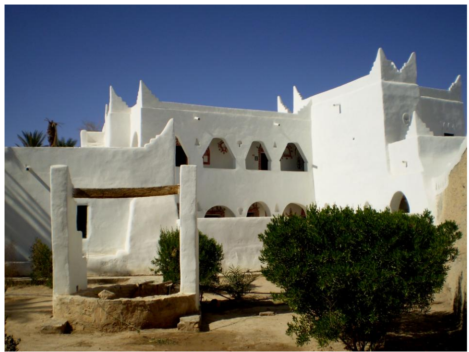
A traditional house in Ghadamis, Libya,