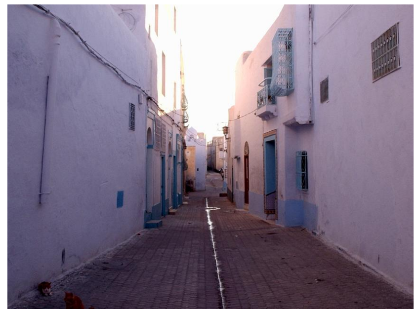
A narrow street running through a residential area in Qayrawan, Tunisia.