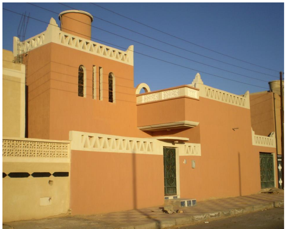
A house in Ghadamis, Libya.