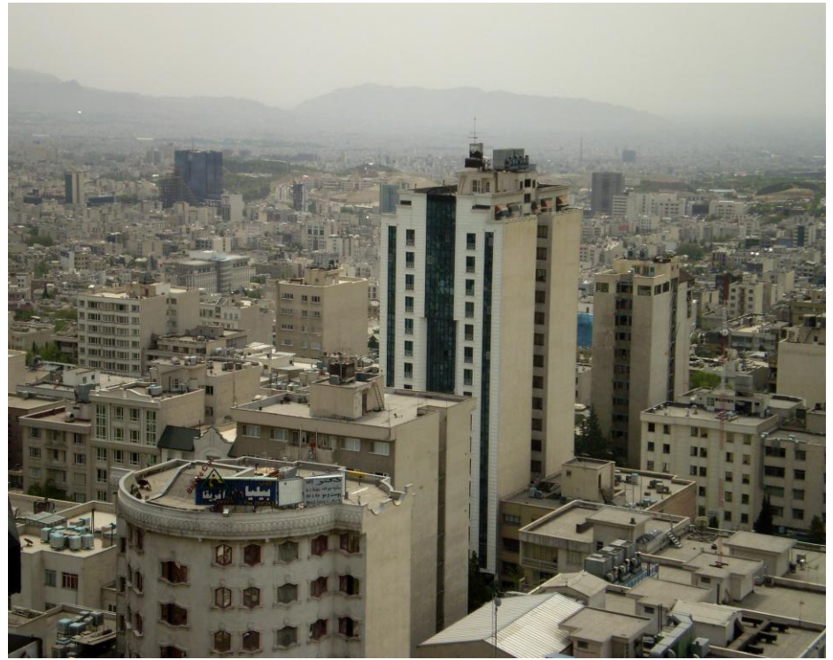
Residential areas in Teheran, Iran.