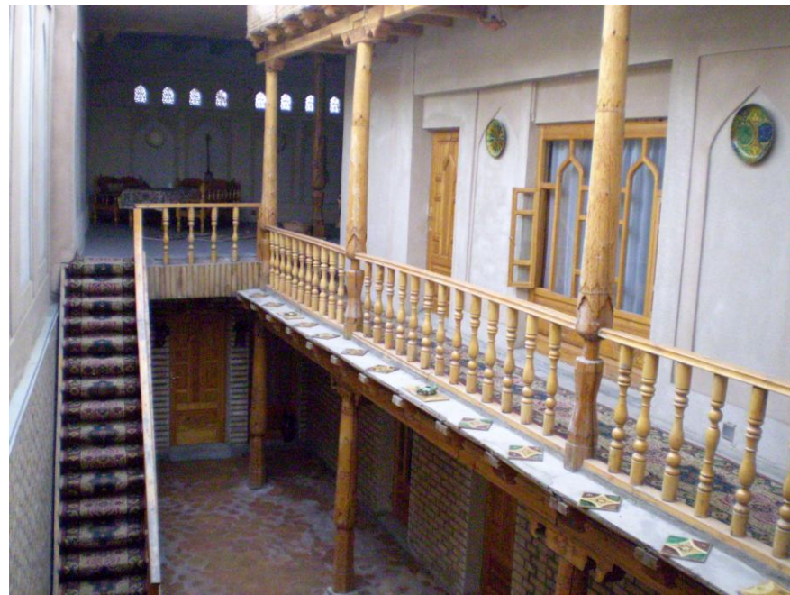
A traditional courtyard house in Bukhara, Uzbekistan.